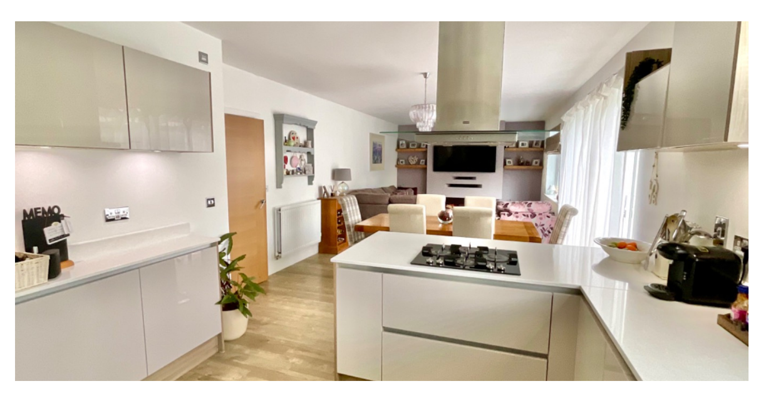
This beautifully presented five bedroom detached family home was built by Avant Homes to the popular Kirkham design, offering modern contemporary, spacious living accommodation close to Daventry Town Centre and must be viewed to be fully appreciated.

The property benefits from a stunning open plan family/dining/kitchen space which really is the hub of this modern spacious family home.