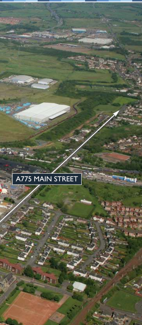
A775 MAIN STREET