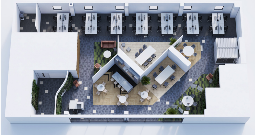
CGI SHOWING THE PROPOSED 'PLUG N' PLAY' LAYOUT

* this timeline is based on previous experience but may change subject to availability of labour and furniture supply line.