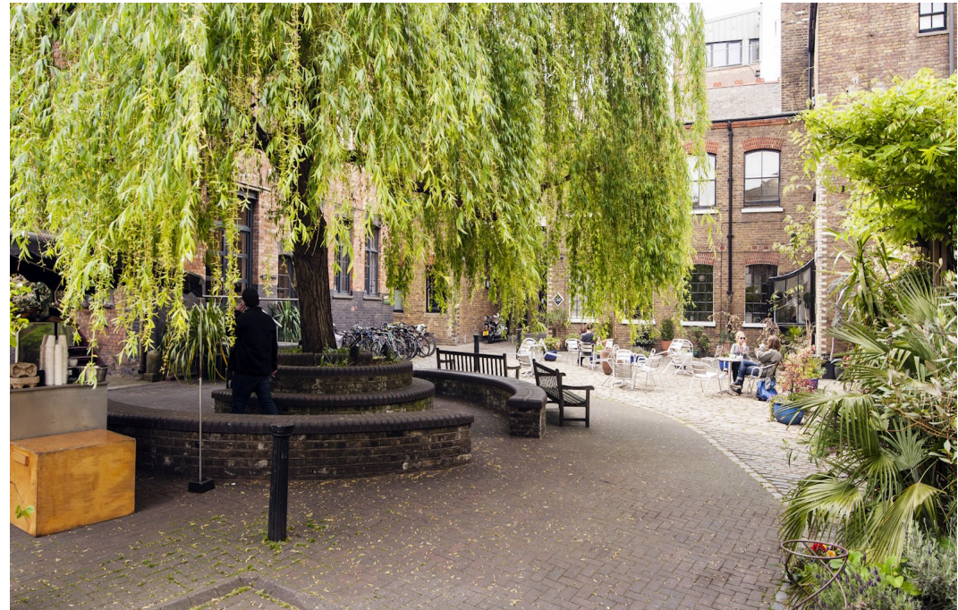
Charity House (right), 14-16 Perseverance Works, London, E2 8DD