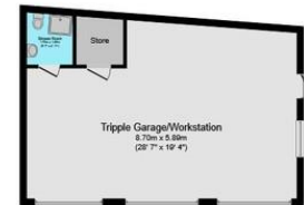
Ground Floor Floor area 49.3 m 2 (531 sq.ft.)