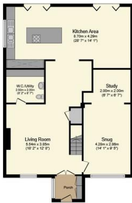
Ground Floor Floor area 105.2 m 2 (1,132 sq.ft.)