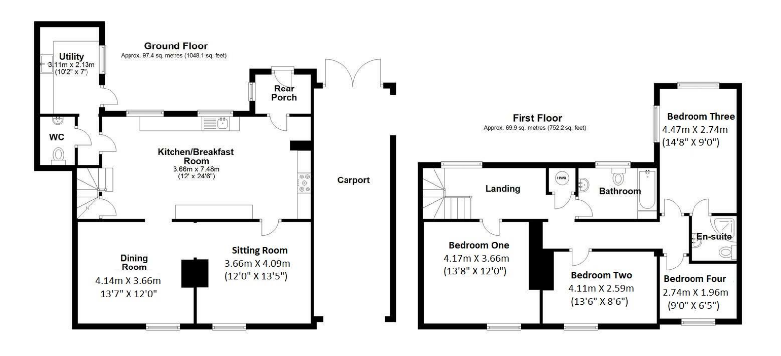
Total area: approx. 167.2 sq. metres (1800.2 sq. feet)