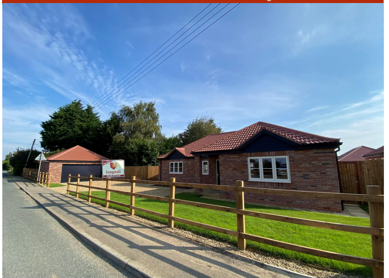
'The Magnolia- 'The Rookery', Beck Bank, West Pinchbeck, Spalding PE11 3QN