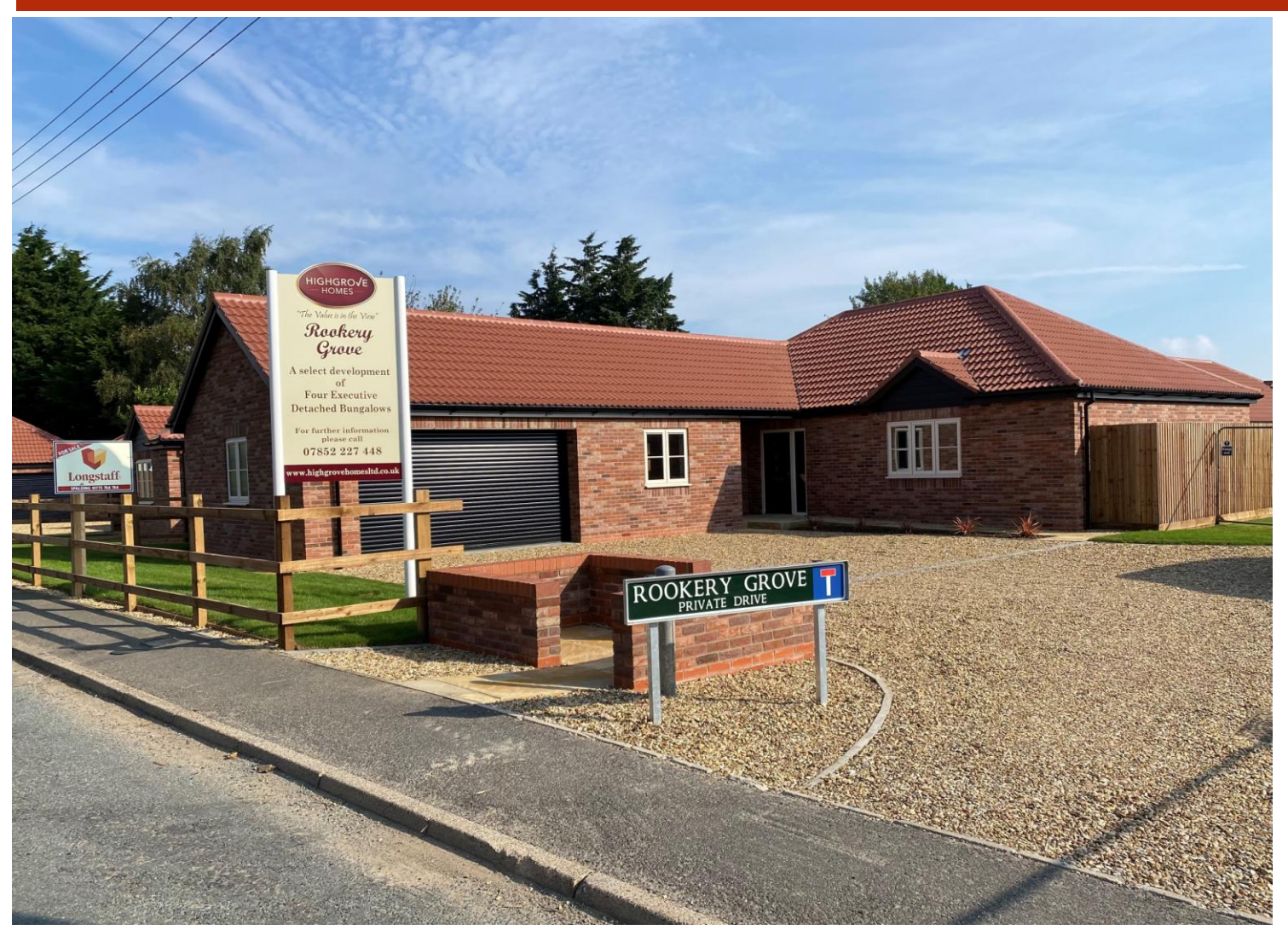
Plot 2, Rookery Grove, Beck Bank, West Pinchbeck, Spalding PE11 3QN

SPALDING RESIDENTIAL: 01775 766766 www.longstaff.com