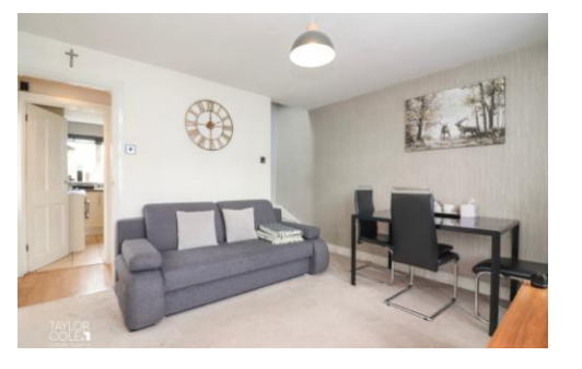
Brookweed £210,000 Amington, Tamworth, , B77 4EB