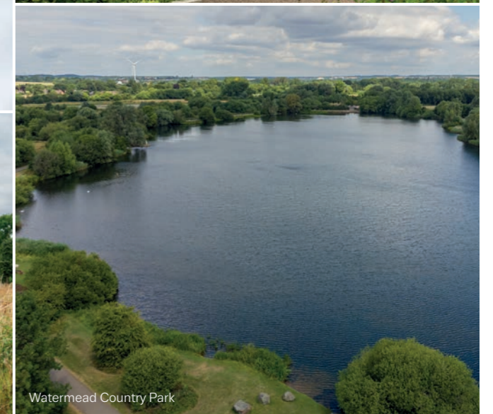
Watermead Country Park

As part of a sustainable urban extension consortium of approximately 2000 homes, our stunning new development consists of 146 plots that offer an excellent choice of 2, 3, 4 and 5-bedroom homes, all beautifully designed inside and out.