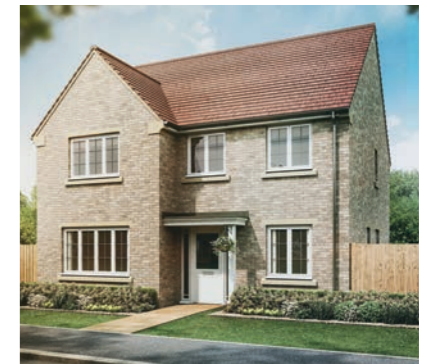
The Severn 4-bedroom detached home