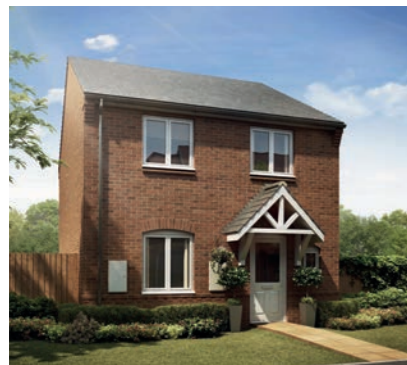
The Dove 3-bedroom home