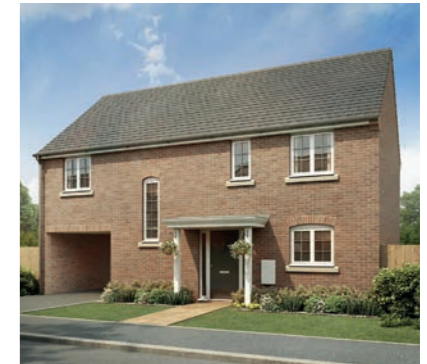
The Rannoch 4-bedroom home