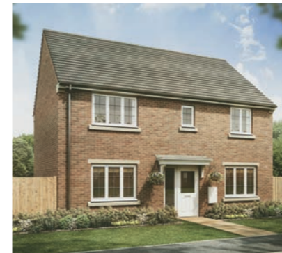
The Solent 4-bedroom detached home