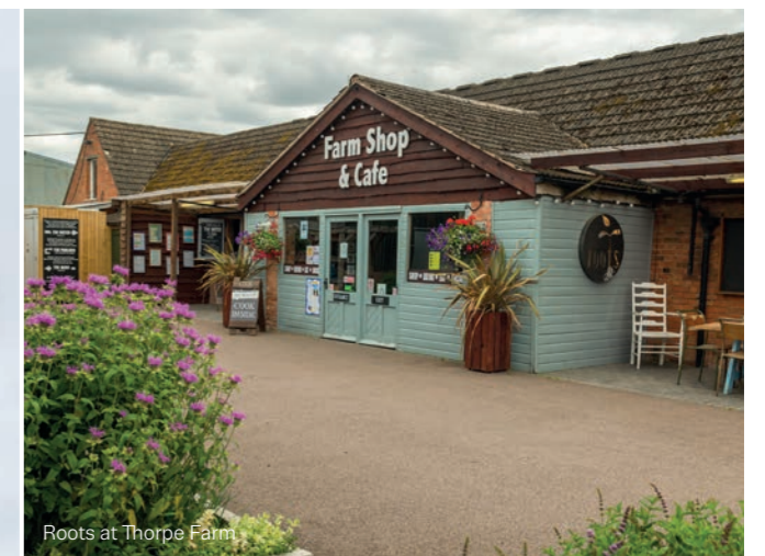
Roots at Thorpe Farm