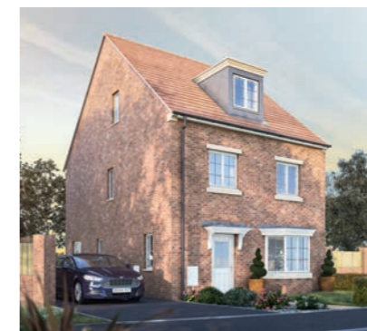
The Sherford 4-bedroom detached home