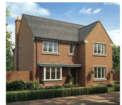
The Seaton 4-bedroom detached home