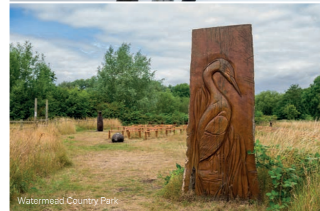
Watermead Country Park