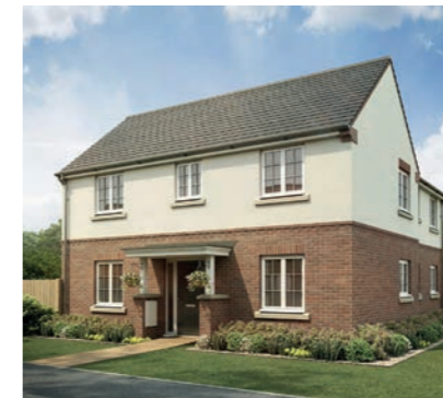
The Beamish 4-bedroom detached home