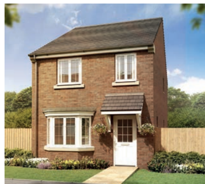
The Lea 3-bedroom home