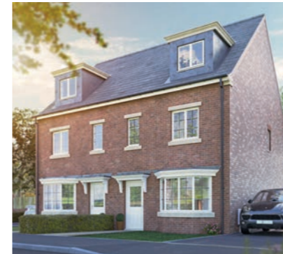
The Solway 3-bedroom home