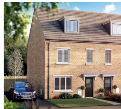
The Henmore 3-bedroom home