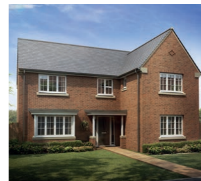
The Medway 4-bedroom detached home