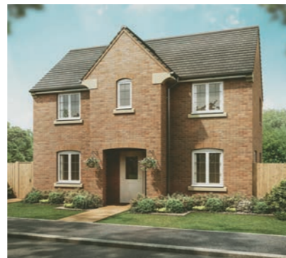
The Dee 3-bedroom home