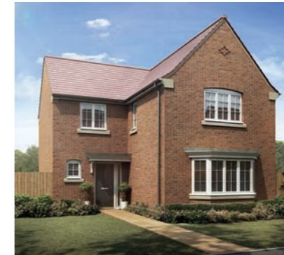
The Soar 4-bedroom detached home