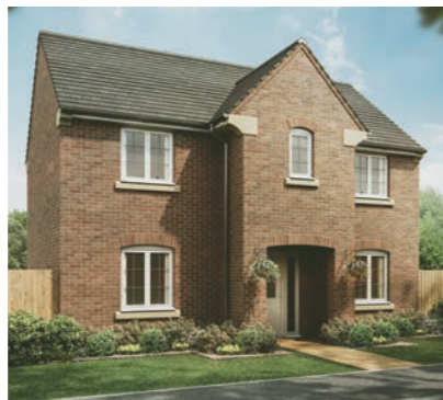
The Nene 3-bedroom home