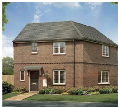
The Douglas 3-bedroom home