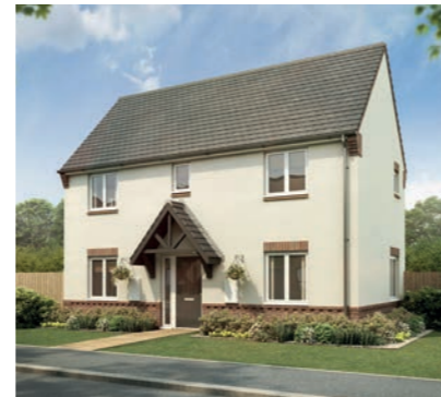
The Teme 3-bedroom home