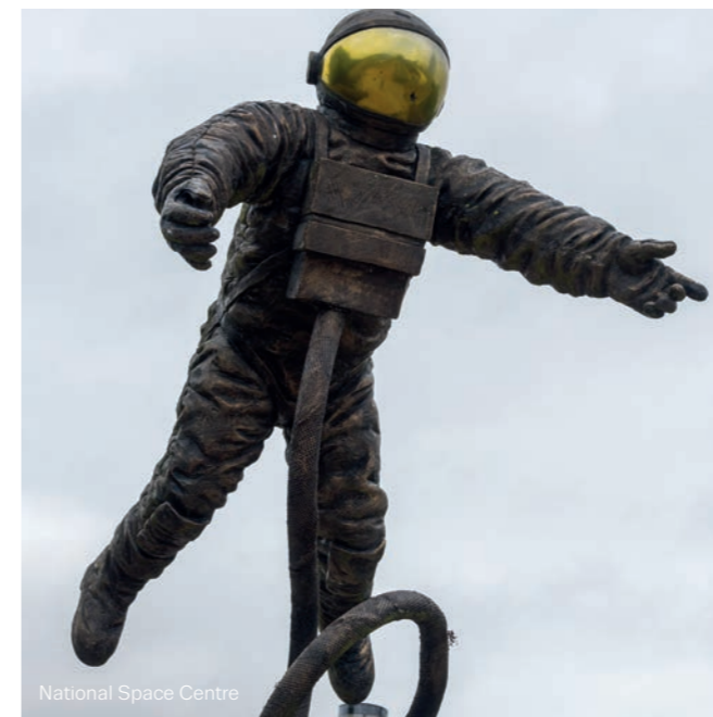
National Space Centre

With all the amenities on your doorstep – from shopping centres, salons and pubs to a farm shop, pharmacy, GPs and an excellent selection of schools – Thorpebury in the Limes has everything your family could ever need. Whether you're a couple, growing family or looking to downsize to a more peaceful location, there is something for everyone at Thorpebury.