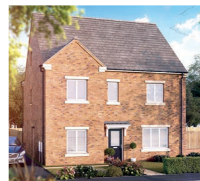
The Stonethwaite 5-bedroom detached home