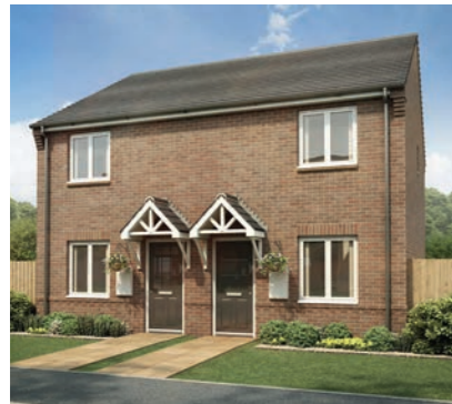
The Rother 2-bedroom home

We have 19 different house types ranging from 2 to 5-bedroom homes. Discover more details, including floor plans, specifications and virtual reality tours by hovering over the QR code with your smart phone.