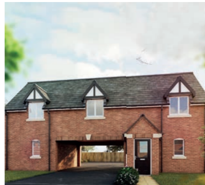
The Glen 2-bedroom home