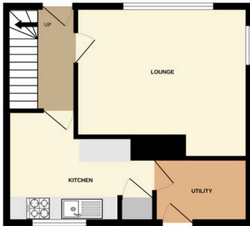
GROUND FLOOR 366 sq.ft. (34.0 sq.m.) approx.