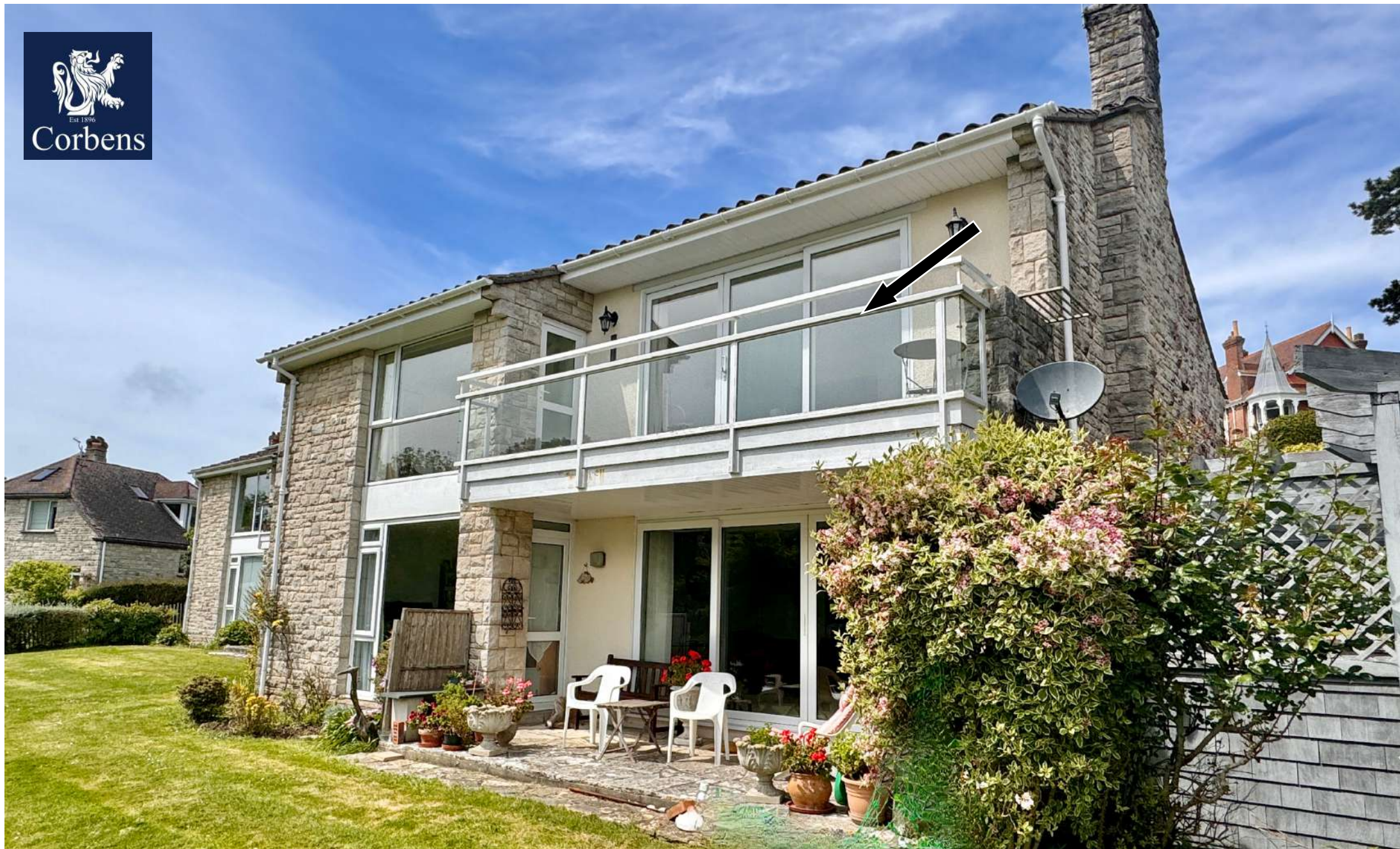
4 HILLCREST, DURLSTON ROAD, SWANAGE £495,000 Shared Freehold