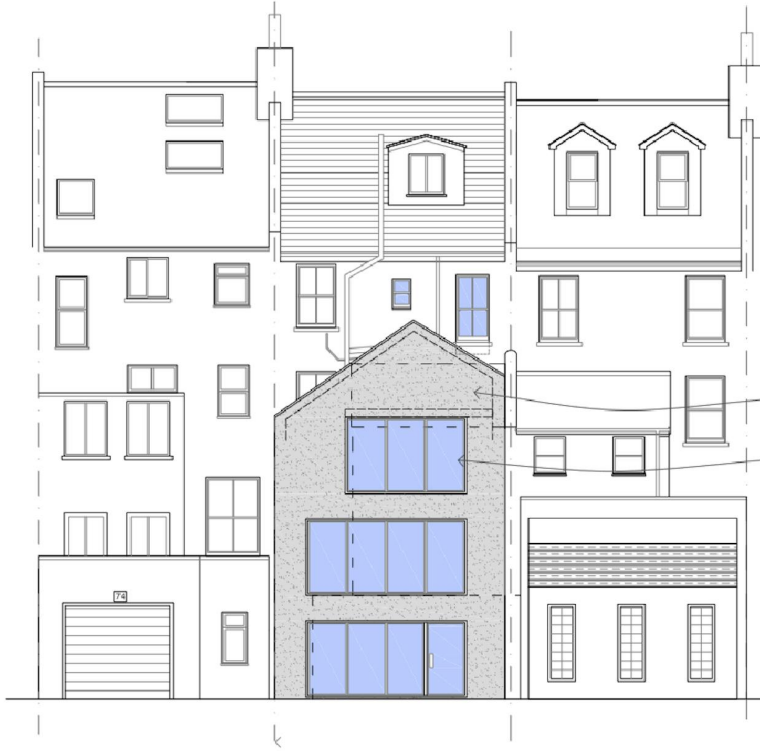
Rear (West) Elevation