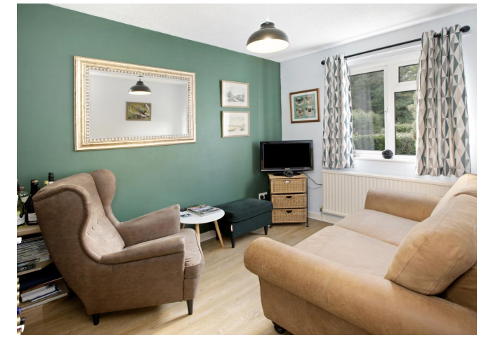
GENERAL REMARKS AND STIPULATIONS:

Tenure: The property is offered for sale freehold by private treaty with vacant possession on completion. Services: Mains water with meter, mains electricity, mains drainage, gas fired central heating. Local Authority: Somerset Council, County Hall, The Crescent, Taunton, Somerset, TAI 4DY