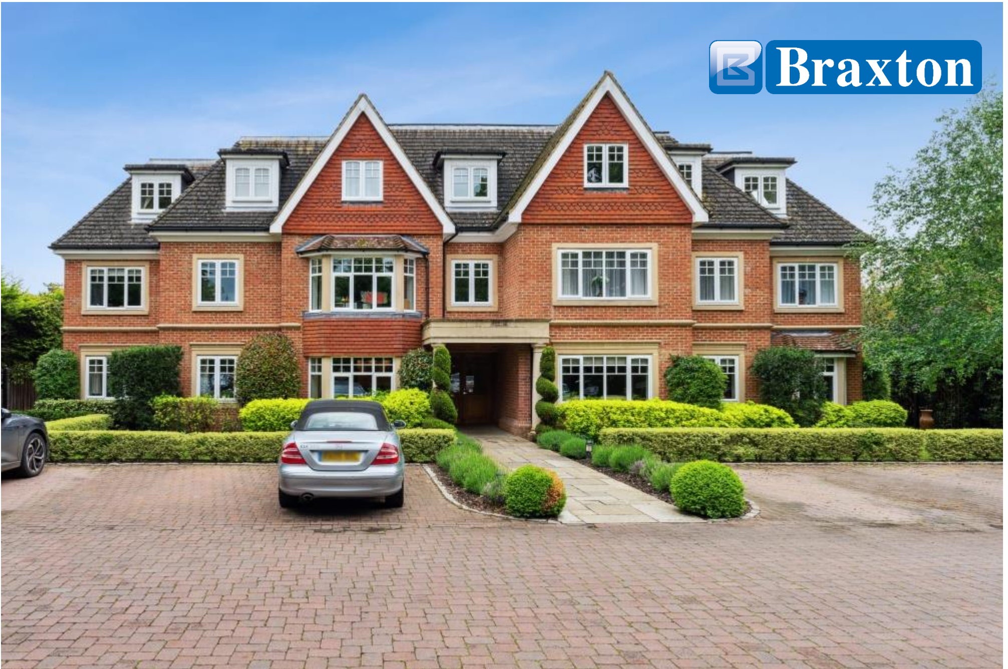
8 Linkside , Shoppenhangers Road, Maidenhead, Berkshire SL6 2QD