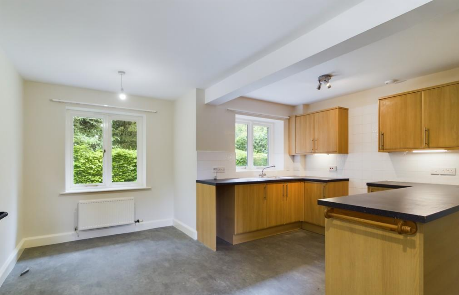
Large Kitchen Dining Room