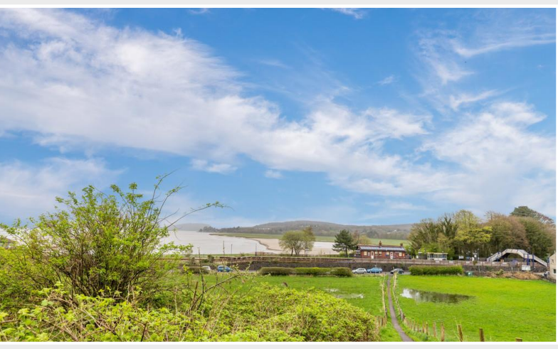
Views from Gowan Brae