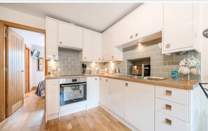
Open Plan Kitchen Area

Location 2 West Tweenways is conveniently located within a short distance of the town centre and amenities. Entering Ambleside from the direction of Windermere, continue straight ahead at the traffic lights at Waterhead along Lake Road bearing left onto the one way system which then forms Wansfell Road. Get into the right hand lane and approximately 100 yards along on the right hand side is a turning into a short private lane which gives access to the shared car parking area serving West Tweenways on the right.