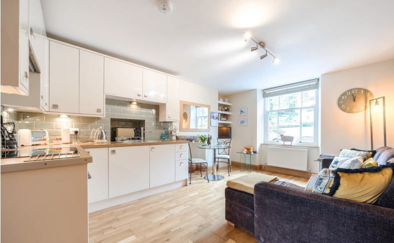
Open Plan Kitchen Area