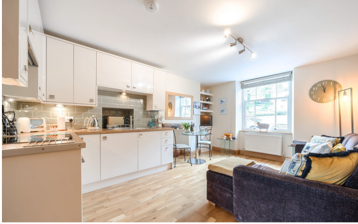
Open Plan Kitchen Area