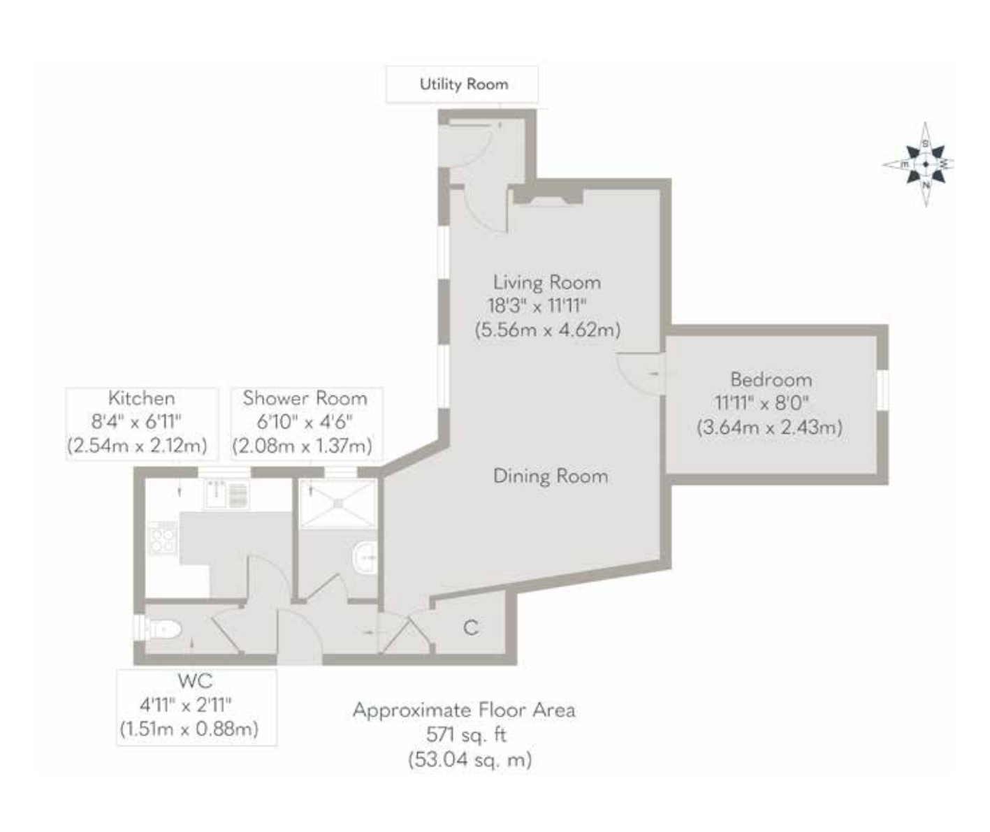
of doors, windows, rooms and any other items are approximate and no responsibility is taken for any error, omission, or mis-statement. This plan is for illustrative purposes only and should be used as such by any prospective purchaser or tenant. The services, systems and appliances shown have not been tested and no guarantee as to their operability or efficiency can be given. Copyright V360 Ltd 2023 | www.houseviz.com

Whilst every attempt has been made to ensure the accuracy of the floor plan contained here, measurements