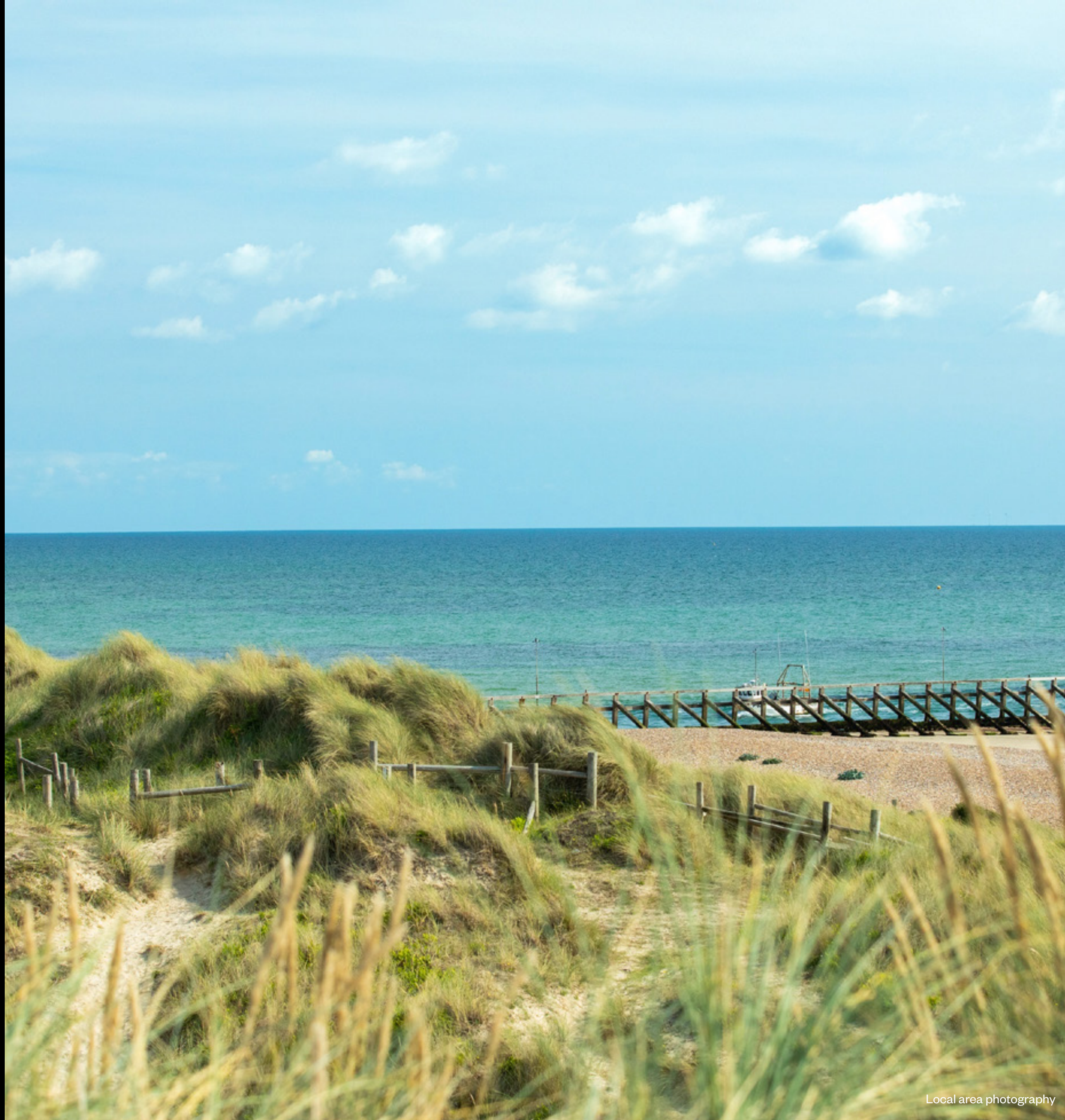
Local area photography

With sea and sand to the south, the South Downs National Park to the north and glorious West Sussex countryside all around, life at Angmering is a breath of fresh air. The family will love exploring – taking in historic Arundel, for instance, or Chichester. Or popping along to Brighton, one of the UK's top destinations for fun and sun. Museums and galleries, adventure centres, play activities, fairs and festivals: come rain or shine there's always something for everyone.