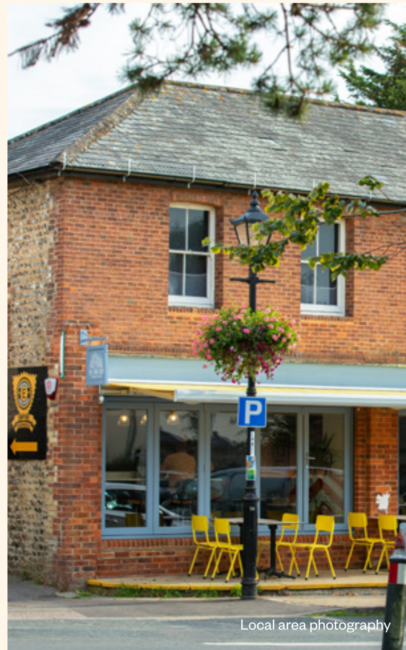
Local area photography