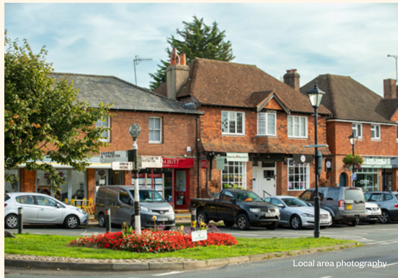
Local area photography