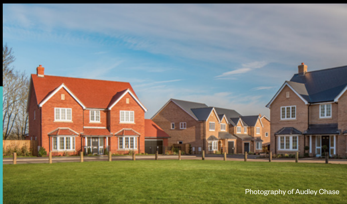
Photography of Audley Chase

See more customer stories, reviews and ratings >