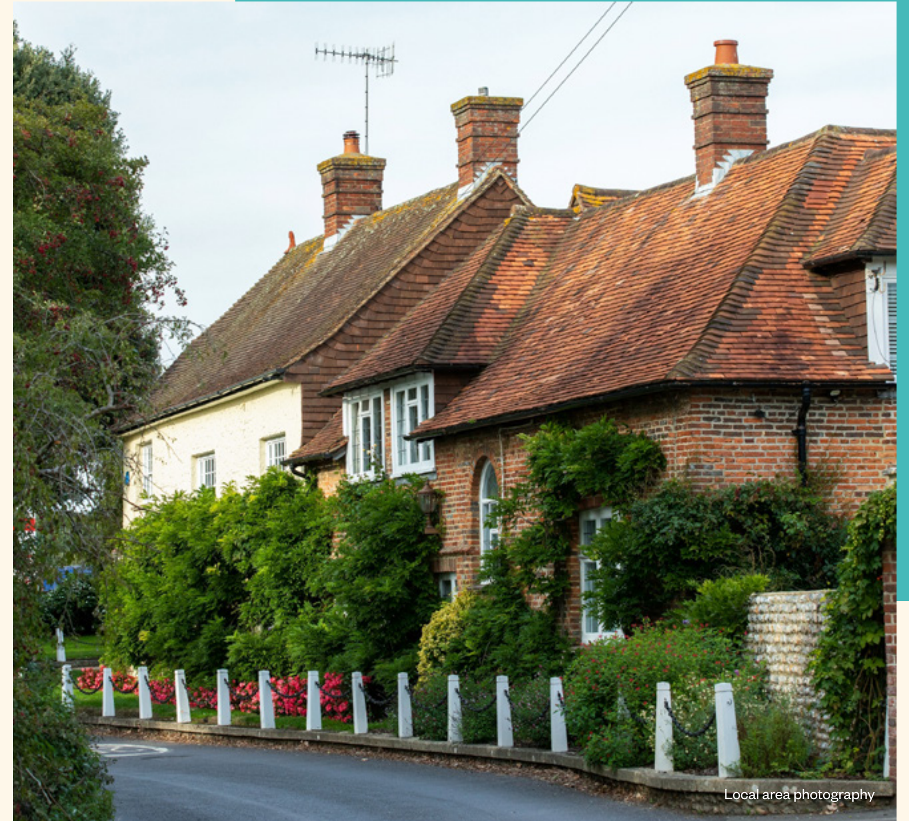
Local area photography