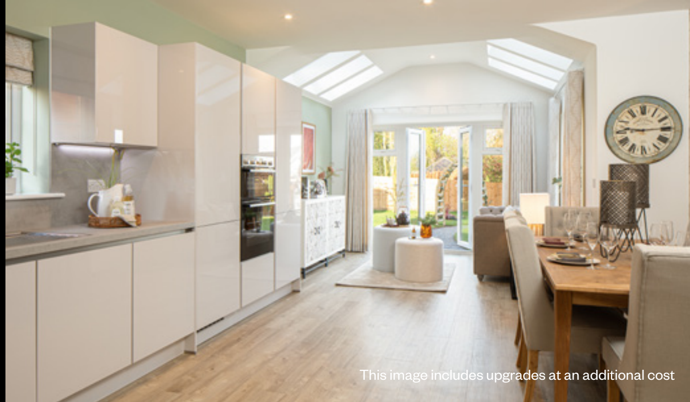
This image includes upgrades at an additional cost