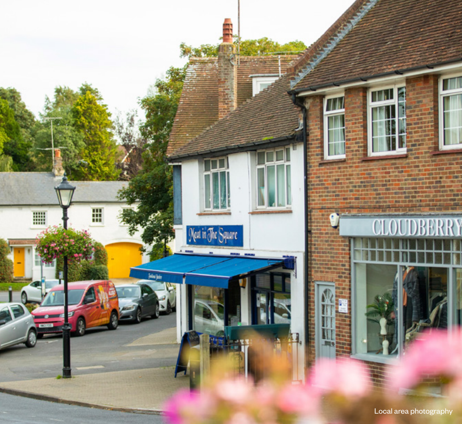
Local area photography