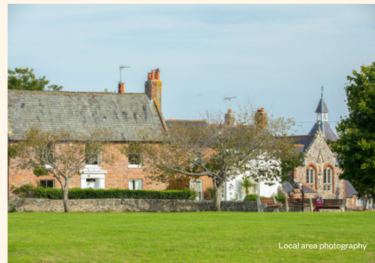
Local area photography