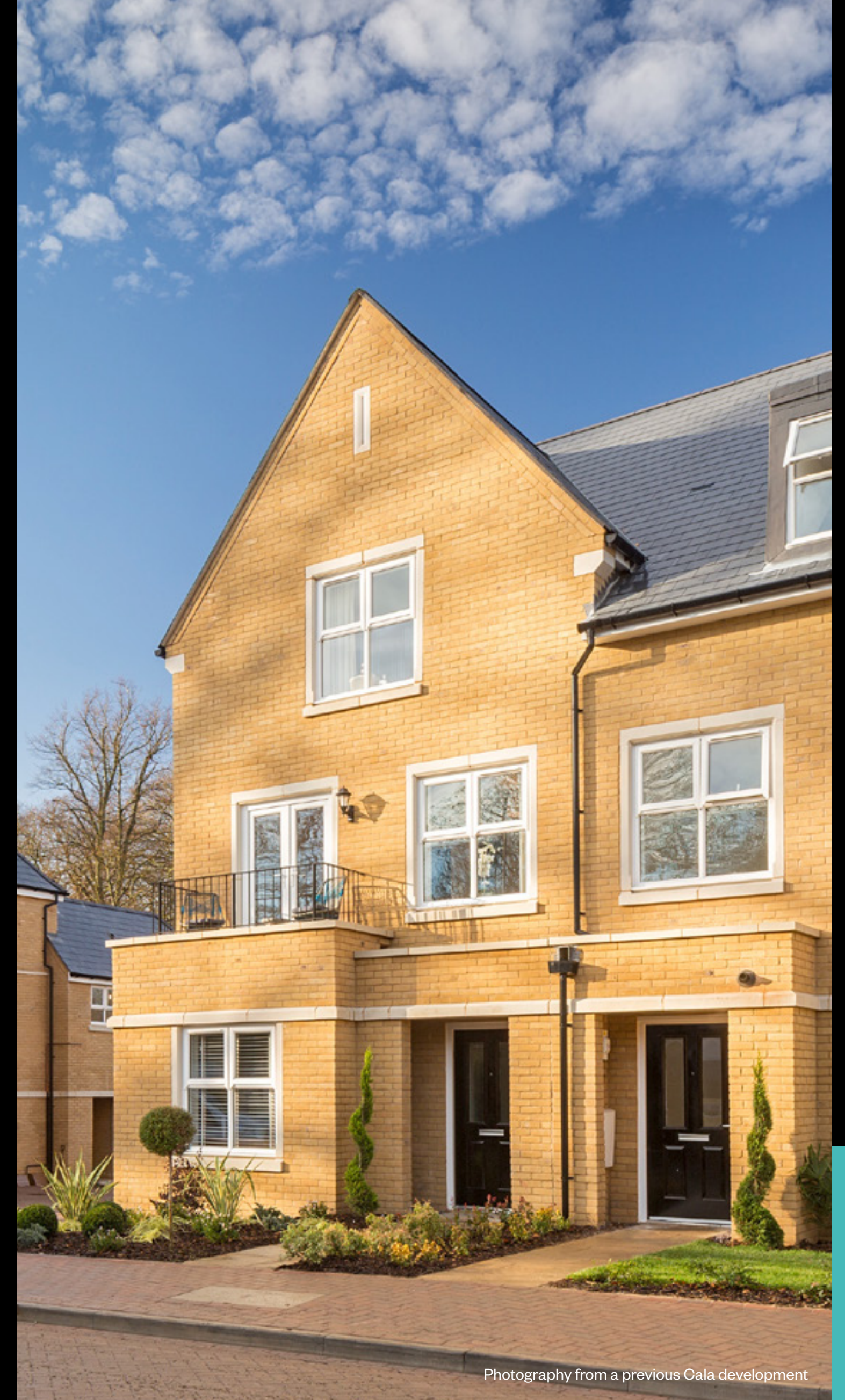
Photography from a previous Cala development