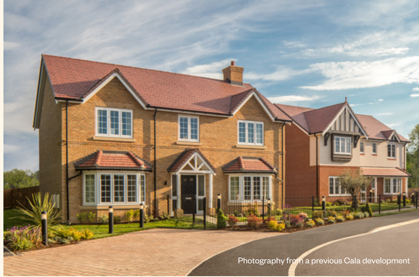
Photography from a previous Cala development