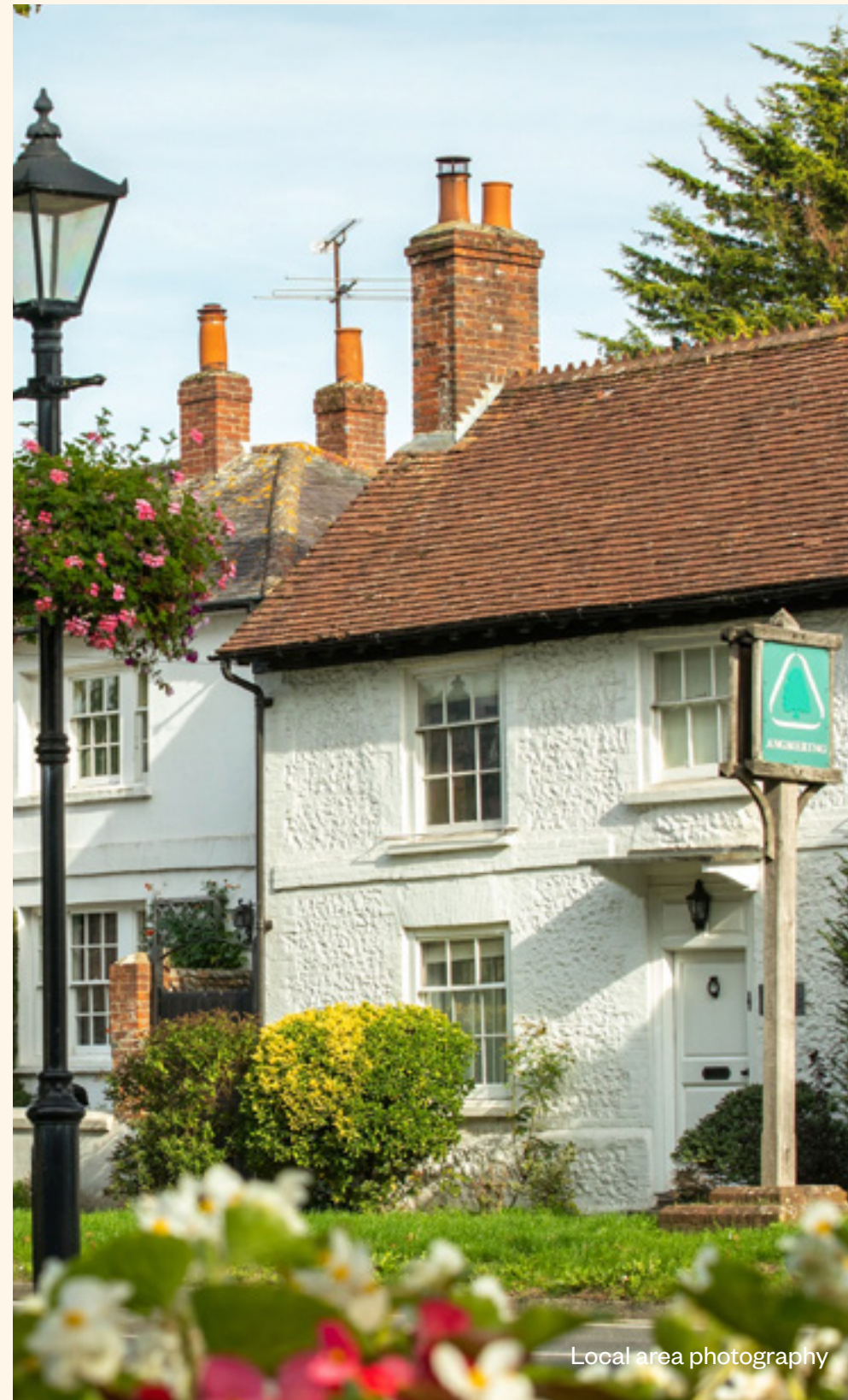
Local area photography

Set on the leafy outskirts of picturesque Angmering in lovely West Sussex, Langmead Place is a new vision of village life. Seamlessly blending traditional values with all the convenience, comforts and style of contemporary Cala homes. This is a vibrant and growing community complete with everything you're looking for in your ideal location. School, shops and workplaces, with open spaces for play and pleasure, sports and socialising, and greenery all around.