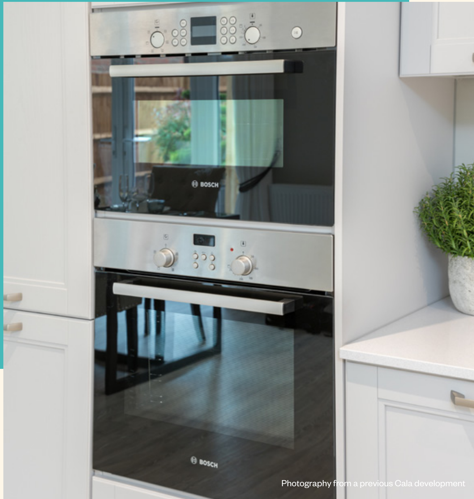
Photography from a previous Cala development