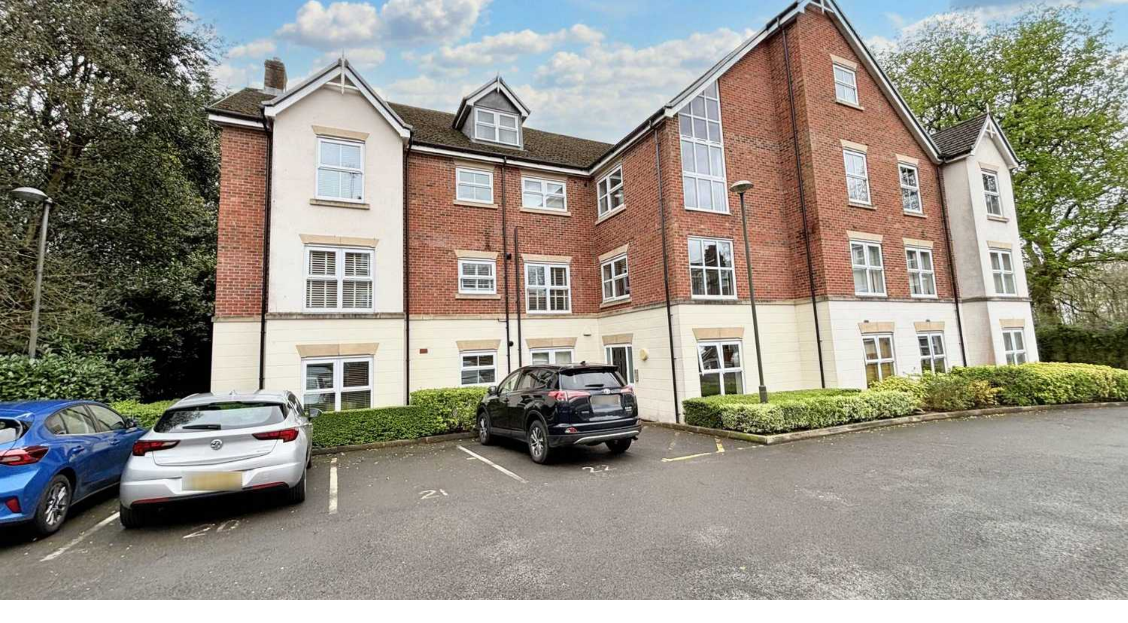
17 The Coppice, Worsley