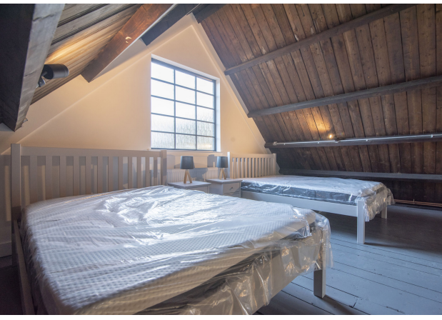
Photos are for illustration purposes only and are of a different commercial unit on site.