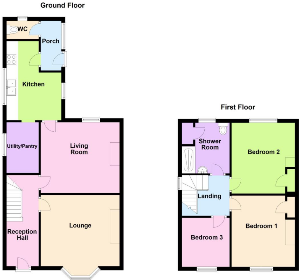
Floor plans are to show layout only and not drawn to scale.

MONEY LAUNDERING REGULATIONS: Under the Money Laundering Rules 2007, The Proceeds of Crime Act 2002 and The Terrorism Act 2000 the Agent is legally obliged to verify the identity of the Client through sight of legally recognised photographic identification (e.g. passport, photographic drivers licence) and documentary proof of address