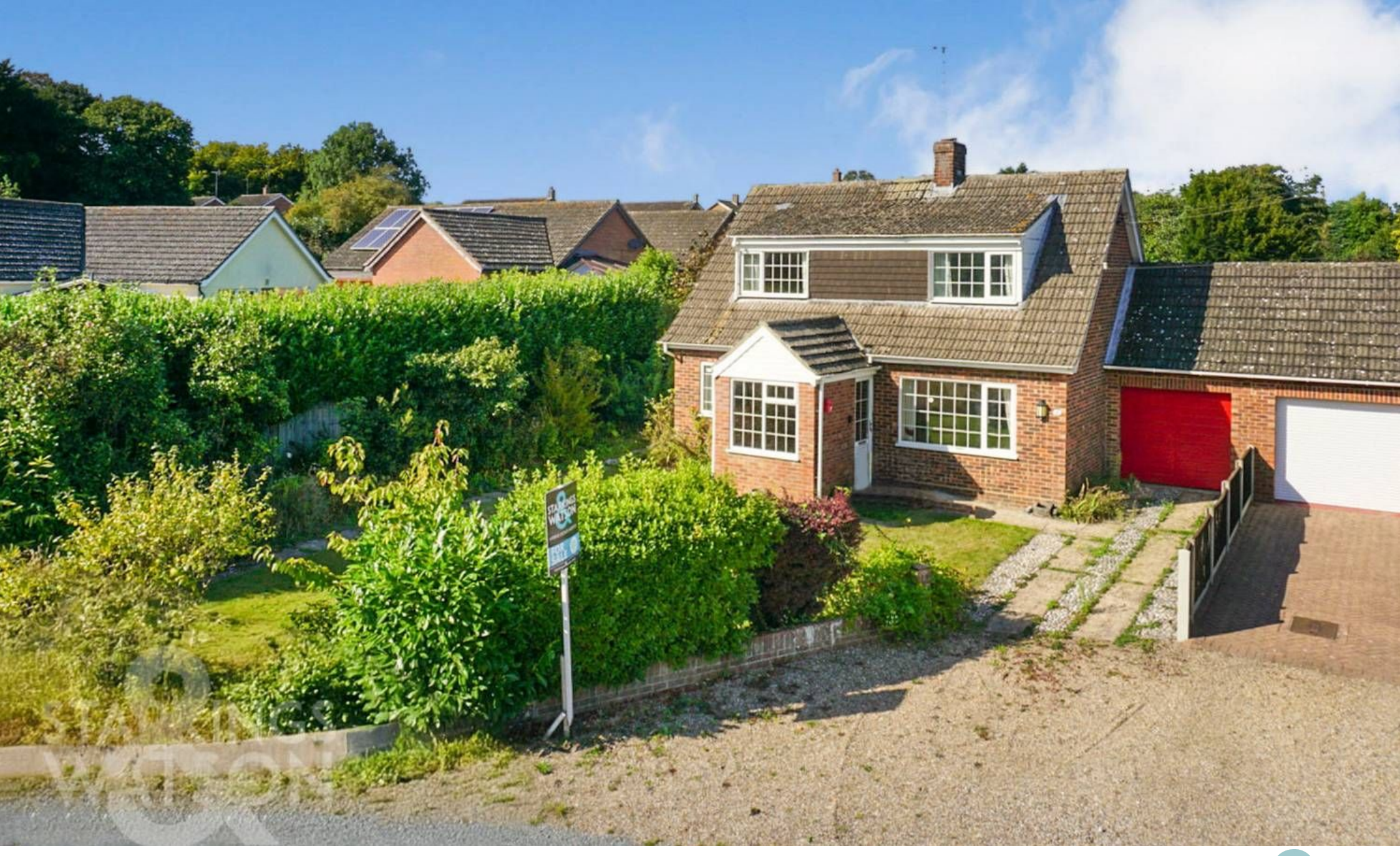
Church Road, Blofield - NR13 4NA