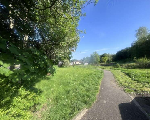
Second Floor Flat Flat 2/1, 391 Ardgay Street, Sandyhills, G32 9EE Offers Over £95,000