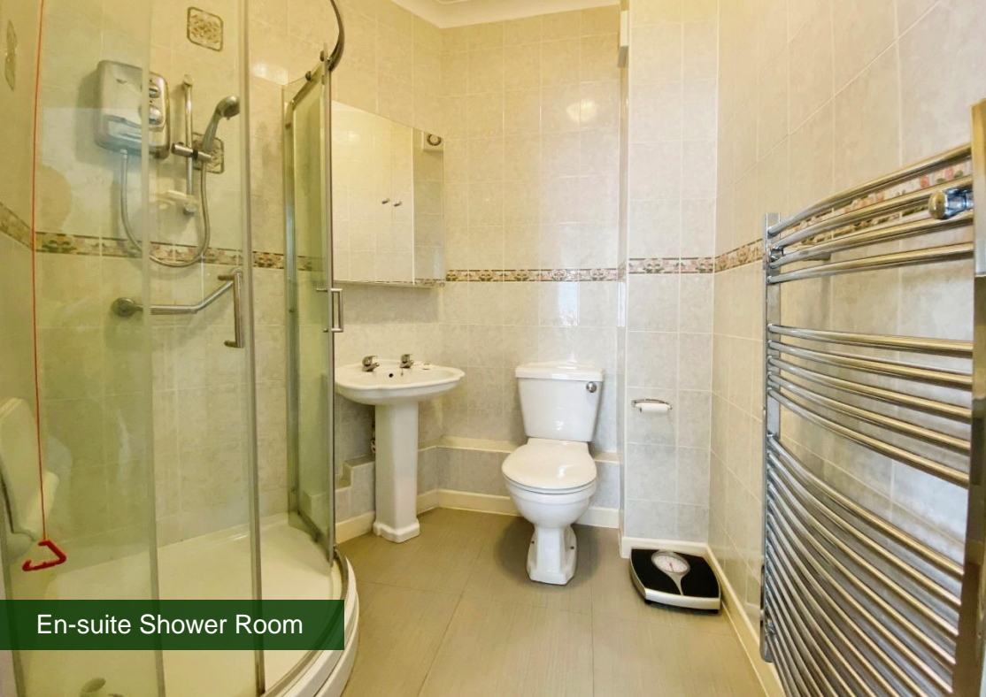
En-suite Shower Room