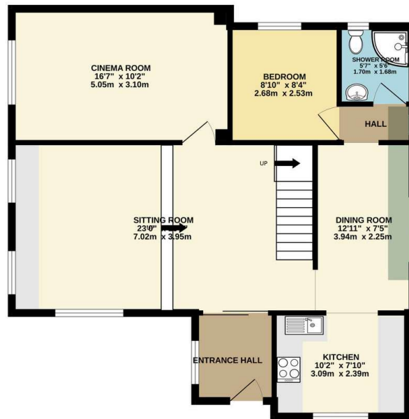
GROUND FLOOR 803 sq.ft. (74.6 sq.m.) approx.