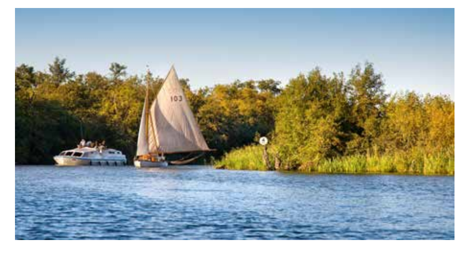
Sailing on the broads

"Walking down to the river is always a treat... peace and quiet, yet not cut off."