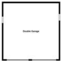
Double Garage Approx 32 sq m / 343 sq ft