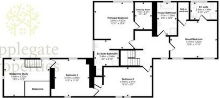
First Floor Approx 119 sq m / 1284 sq ft