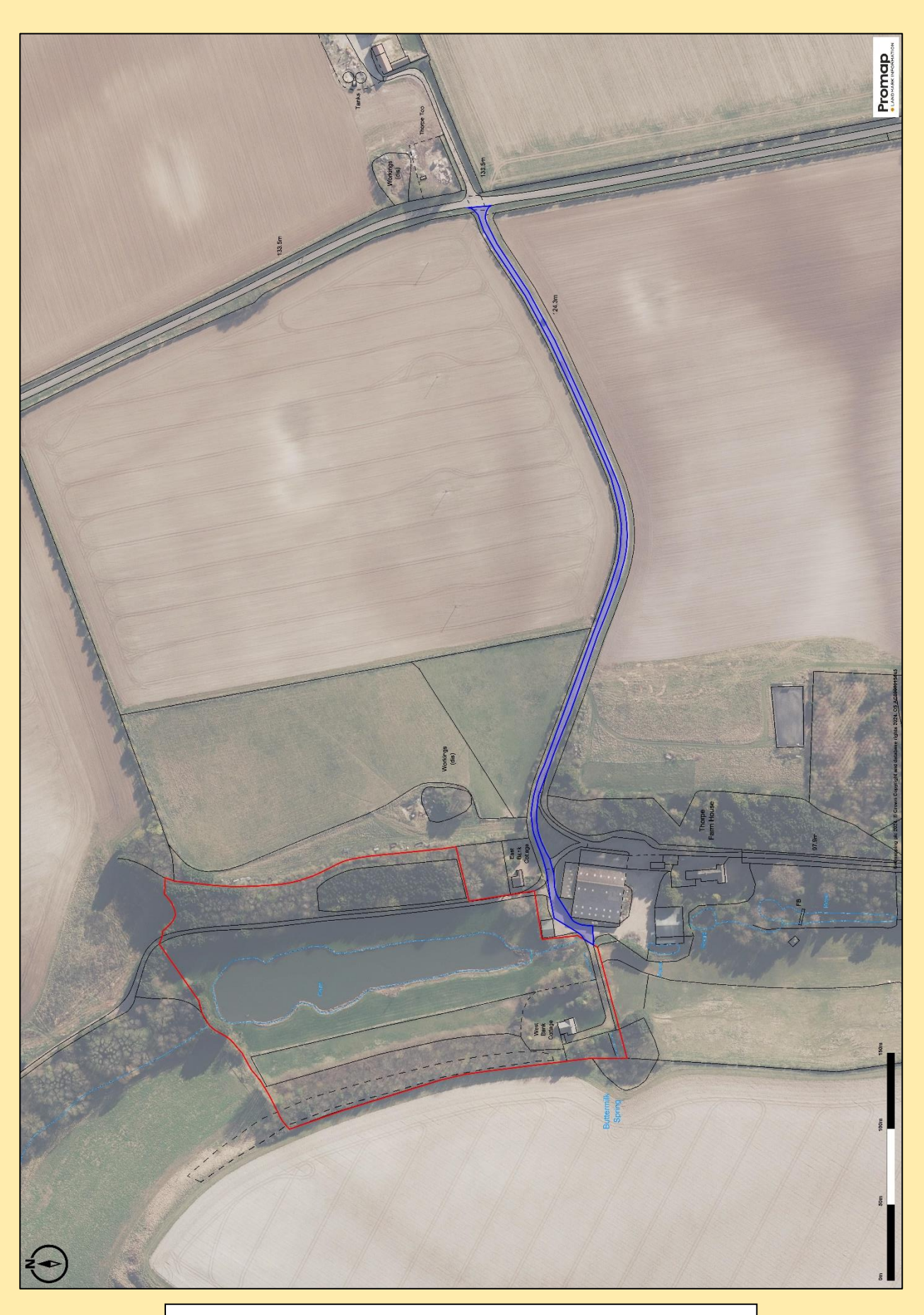
8.77 ACRES (3.55 HECTARES) OR THEREABOUTS OUTLINED IN RED SHARED ACCESS TRACK LEADING TO THE PROPERTY COLOURED IN BLUE FOR IDENTIFICATION PURPOSES ONLY – NOT TO SCALE