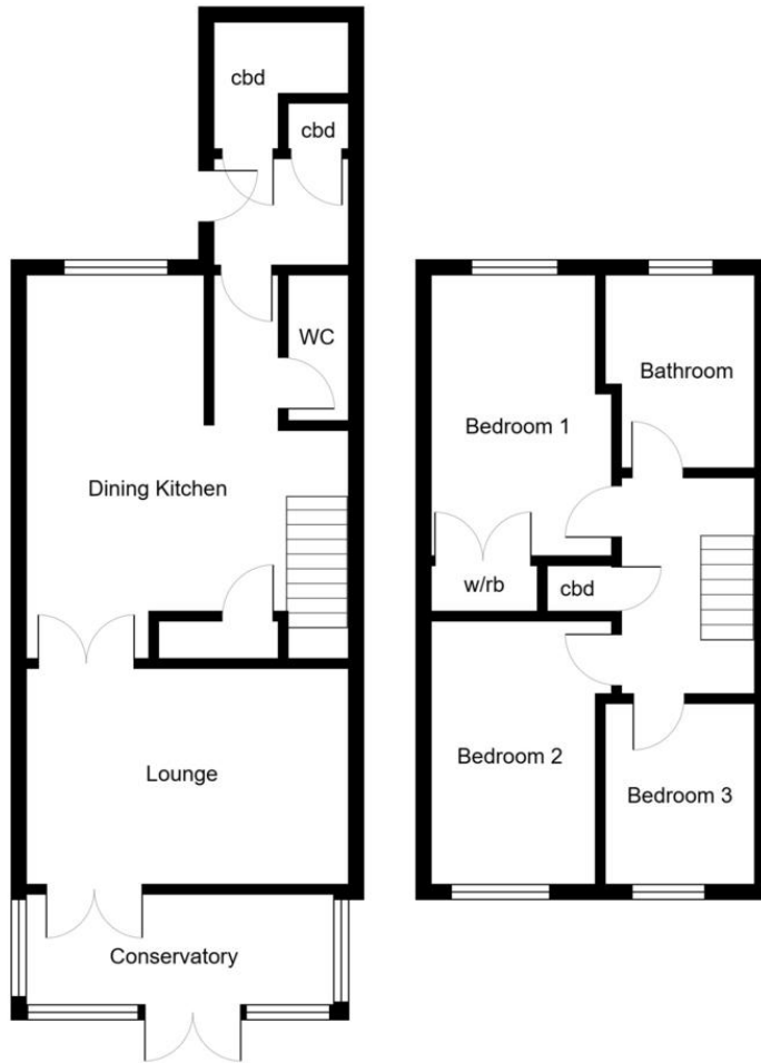
DRAFT FLOOR PLAN - AWAITING VENDOR'S APPROVAL

All measurements are approximate and for display purposes only