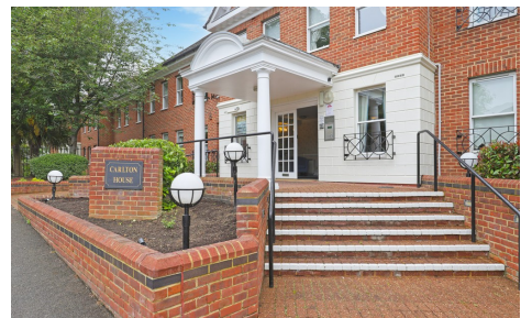
15 Carlton House Algers Road, Loughton, Essex, IG10 4RS