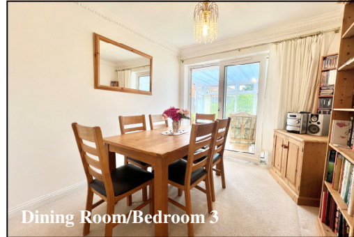
Dining Room/Bedroom 3