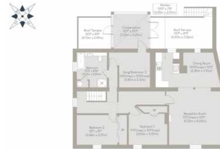
First Floor Approximate Floor Area 136 sq. ft. (124.95 sq. m)