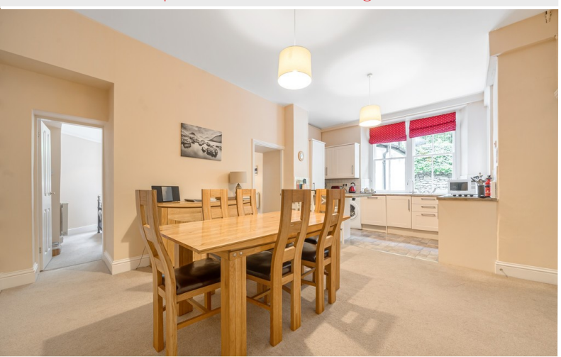
Open Plan Kitchen/Dining Area

Location From Ambleside take the A591 signposted Grasmere and Keswick. Just before the mini roundabout at Grasmere turn right and go by Dove Cottage. Follow the road up to the duck pond. Take the first left then a right signposted Wood Close. Follow the sweeping drive and White Moss can be found ahead with access at the rear of the building.