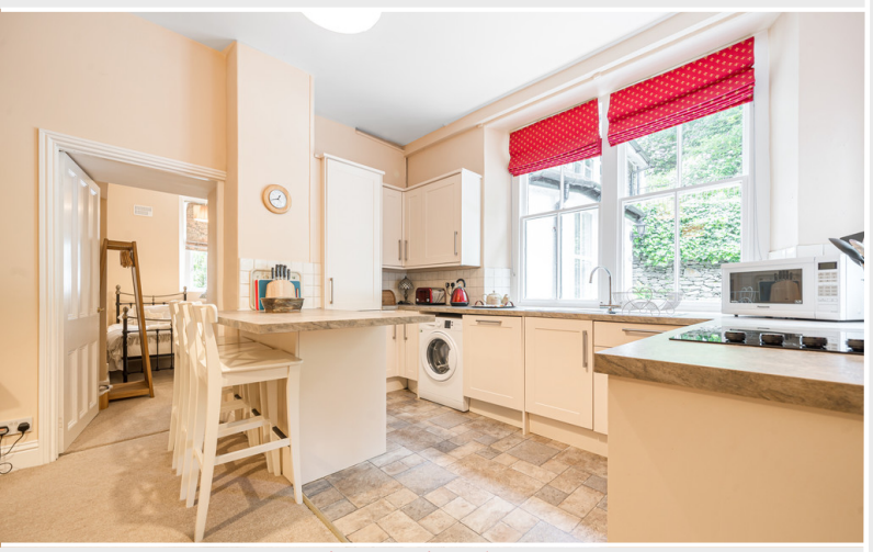
Open Plan Kitchen/Dining Area