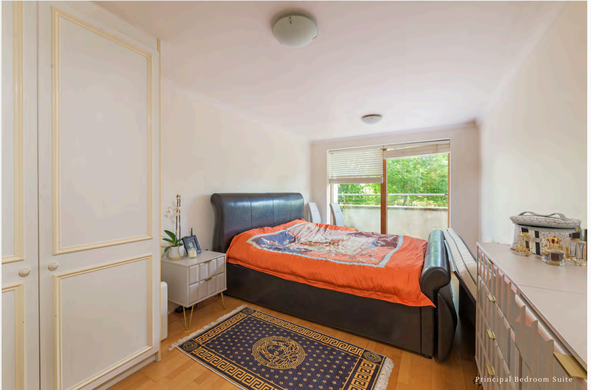
Principal Bedroom Suite

This property boasts two double bedrooms both complete with En-Suite bathrooms. The Principal Bedroom also benefits from built in storage and access to a south facing balcony, a wonderful sun trap over looking the leafy streets of Chiswick.