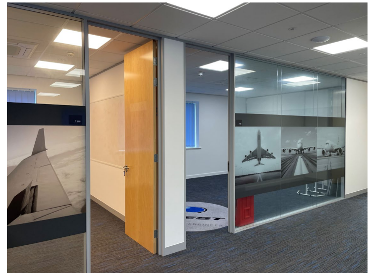
10 Brabazon Office Park - To Let