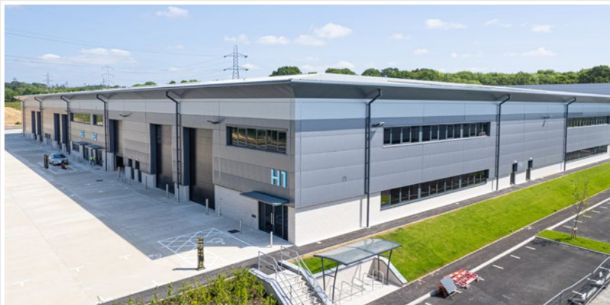
Phase II construction completed