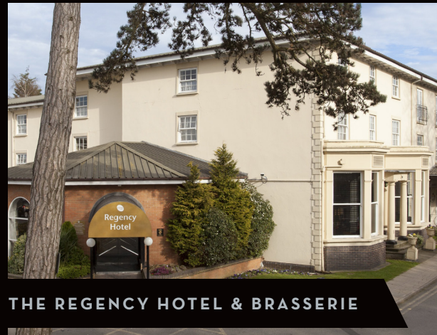
THE REGENCY HOTEL & BRASSERIE