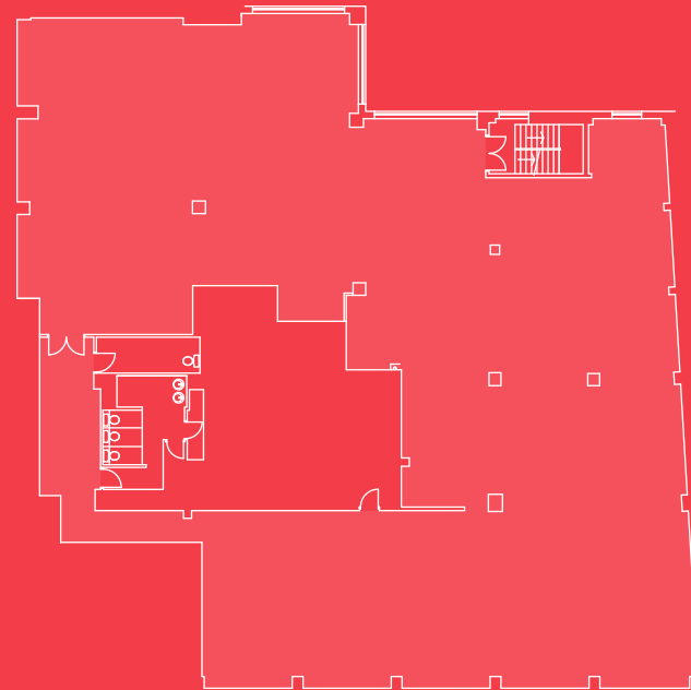
Lower Ground Floor: 6,985 sq ft / 649 sq m