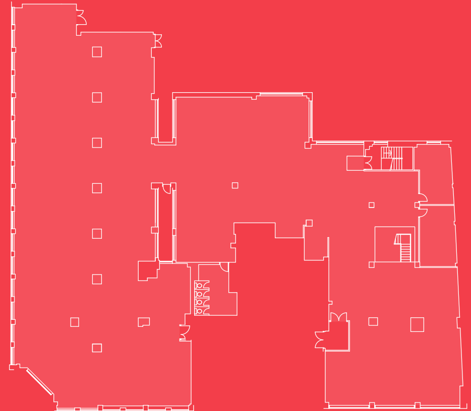
Ground Floor: 11,870 sq ft / 1,103 sq m