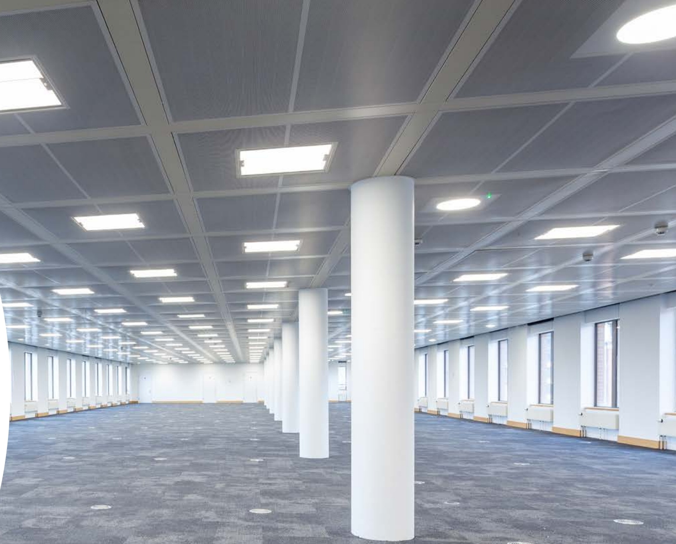
Fourth floor West

An EPC is available, details available on request.