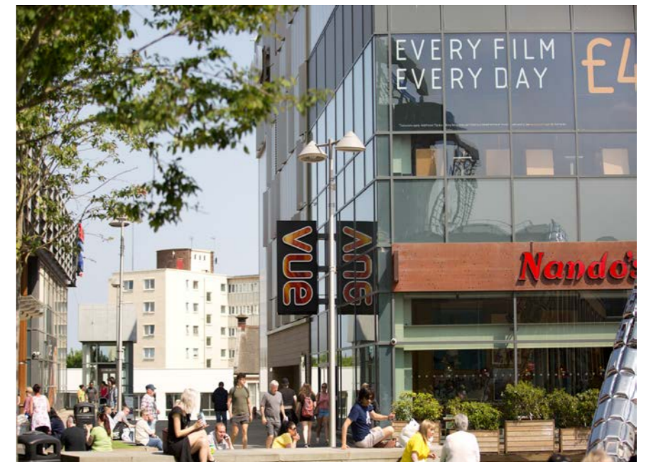
Gateshead Town Centre

Pedestrian access to Newcastle Quayside is enabled via the Millennium Bridge, broadening the amenity to occupiers at Baltic Place.