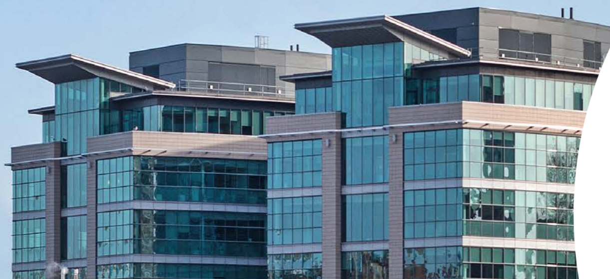
BALTIC PLACE EAST