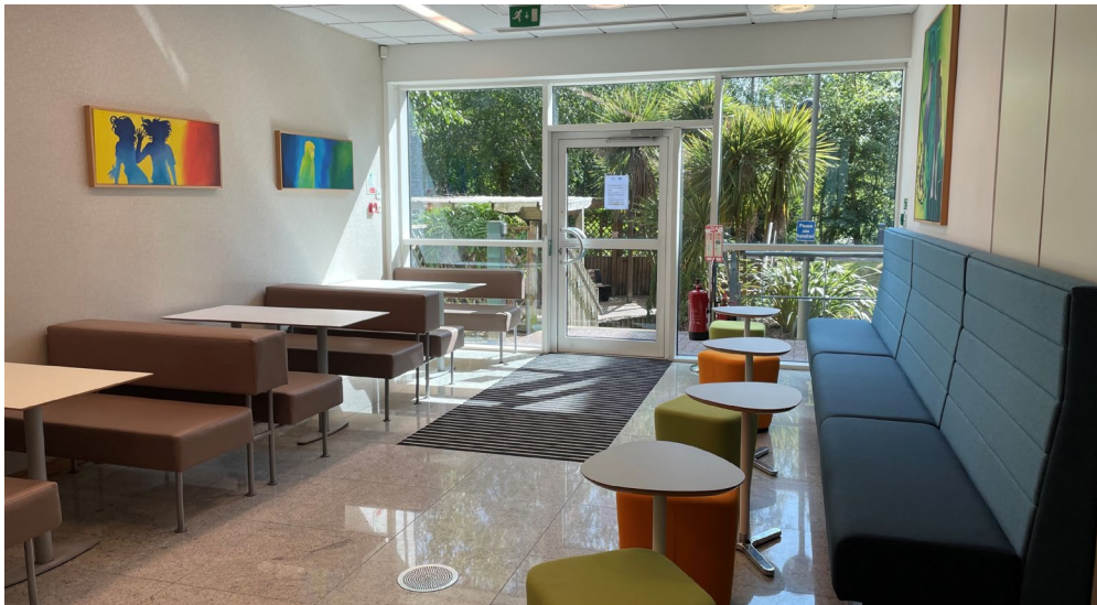
Gadeon House - To Let