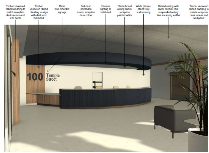
View from Lobby to Reception Desk