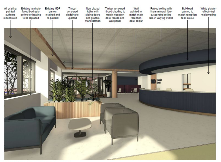
View of Reception from Temporary Partition