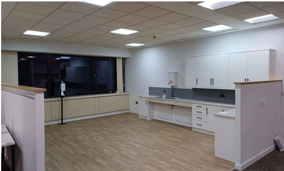
100 Temple Street – To Let

Please contact the joint sole agents for any further information, or to arrange a viewing.