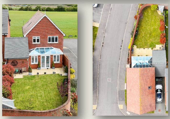
Viewing is Strictly by Appointment through Reaston Brown