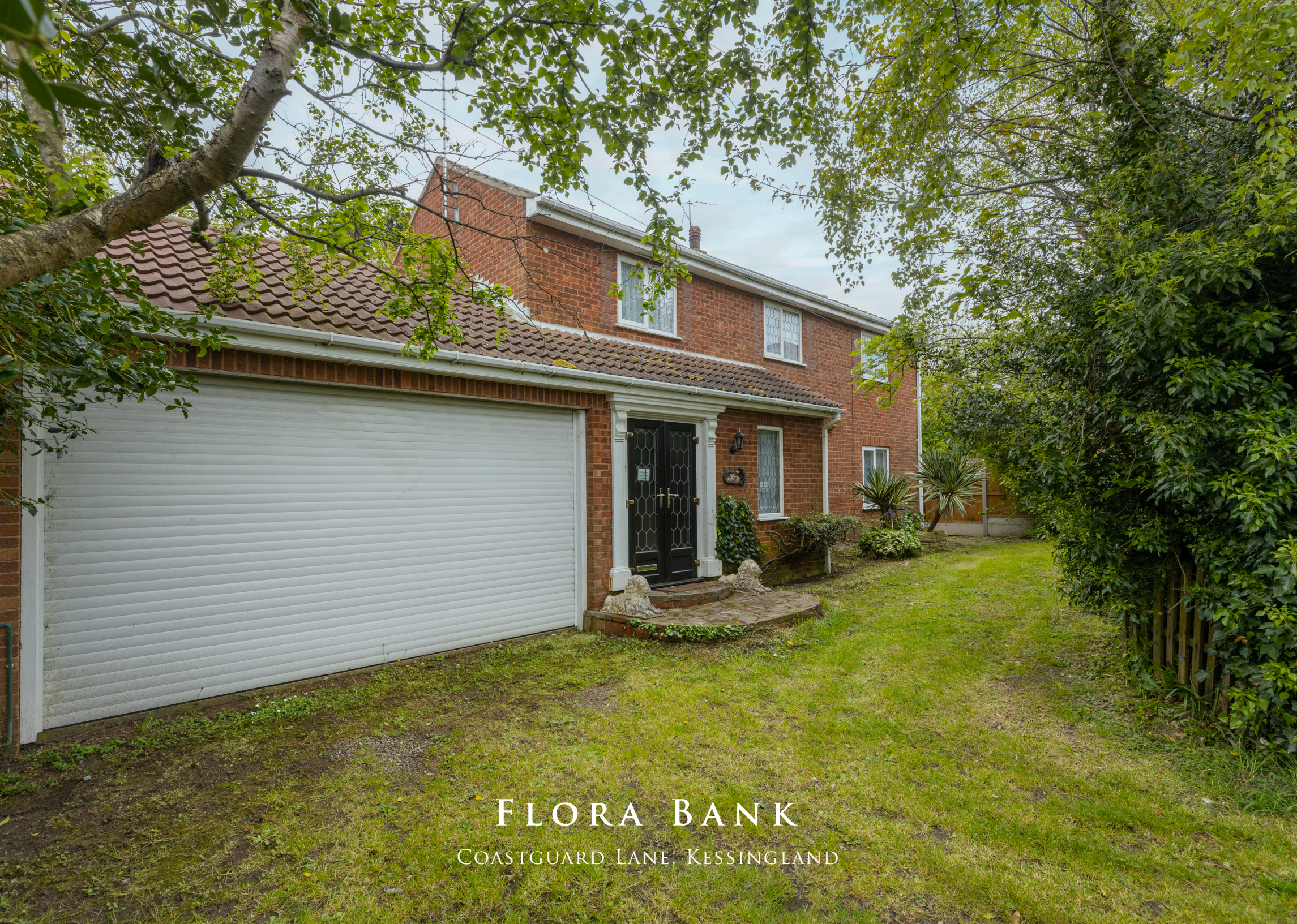
FLORA BANK COASTGUARD LANE, KESSINGLAND