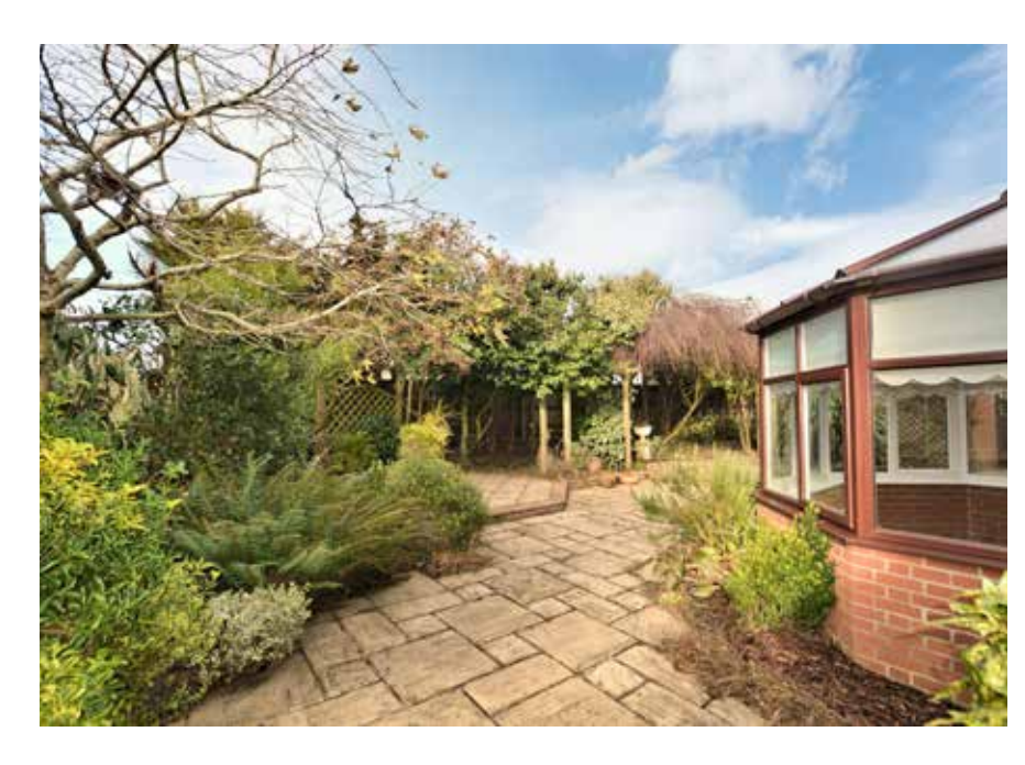
"A bright, peaceful, and comfortable home." THE VENDOR