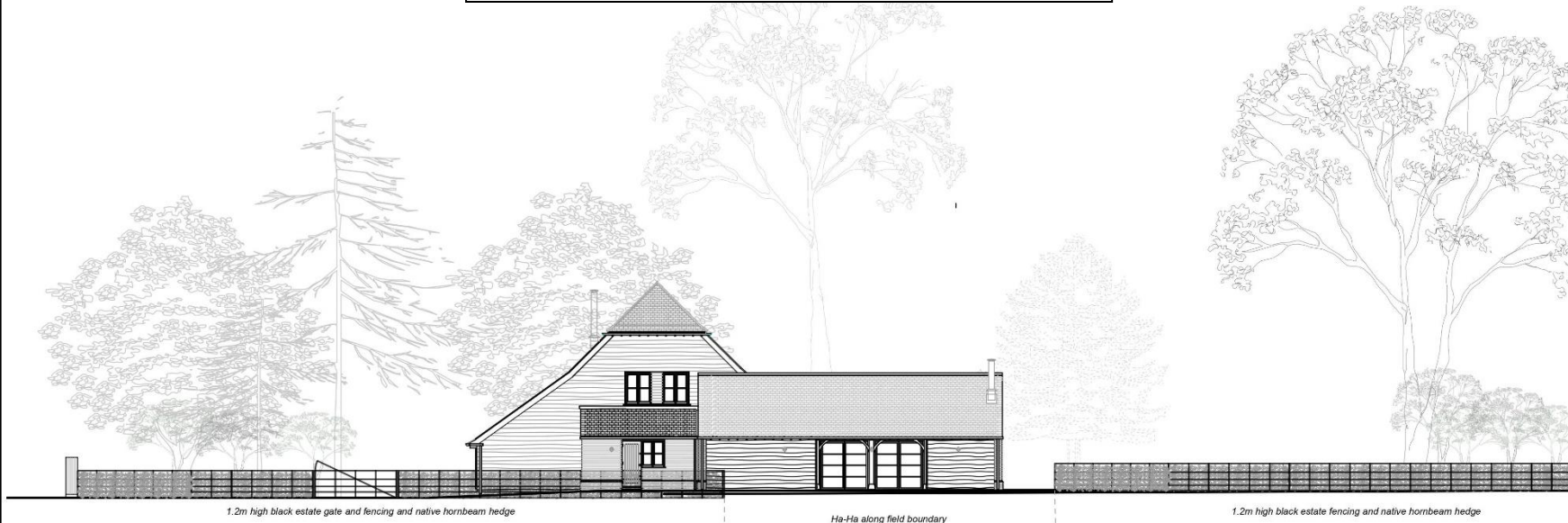
WEST ELEVATION 1:200 @ A3