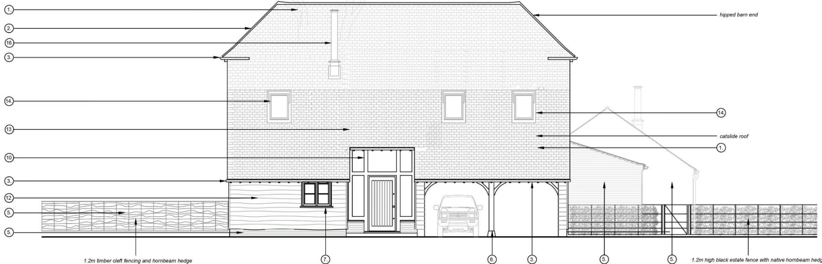
NORTH ELEVATION 1:100 @ A3