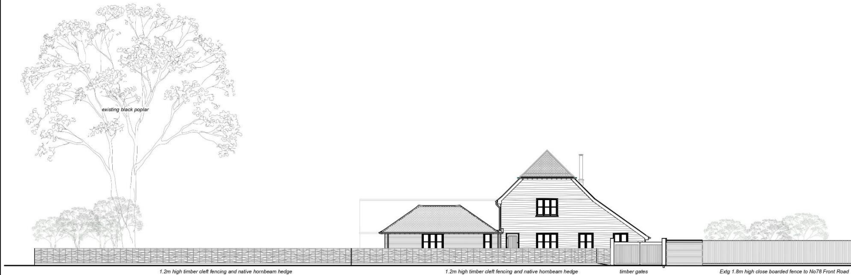
EAST ELEVATION 1:200 @ A3