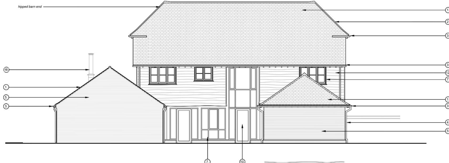
SOUTH ELEVATION 1:100 @ A3